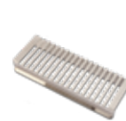
Easy for external vacuum